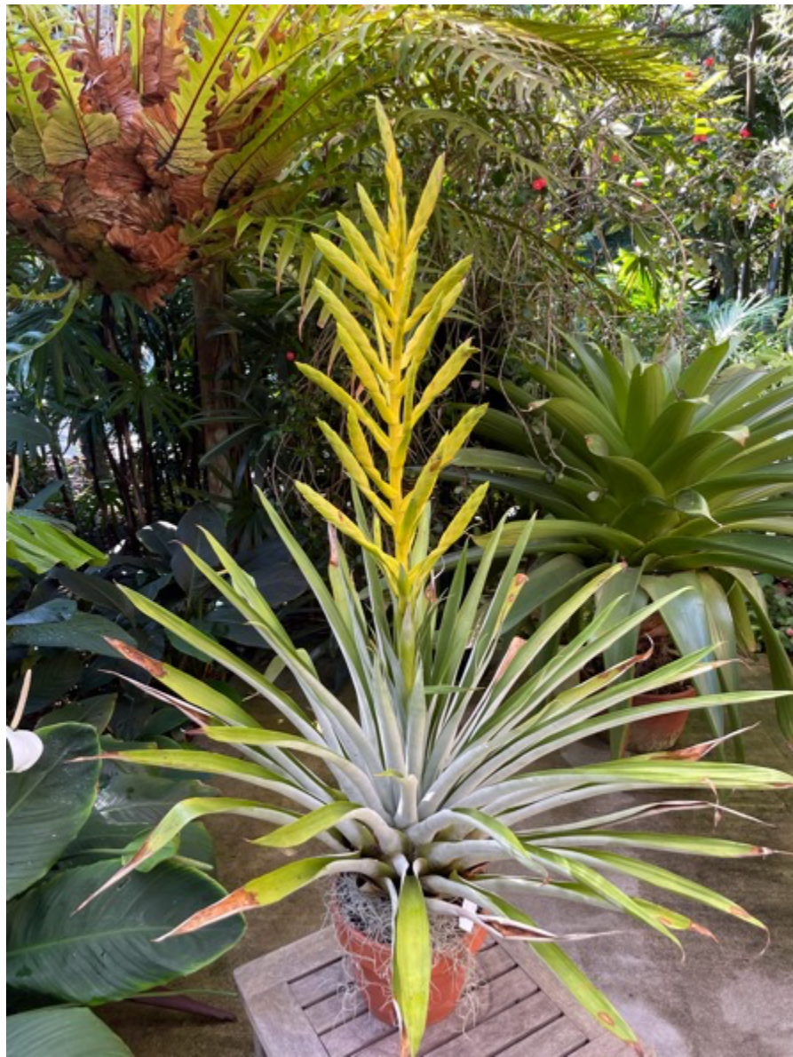
Tillandsia oerstediana is a large species native to Costa Rica taken at Marie Selby Botanical Gardens.